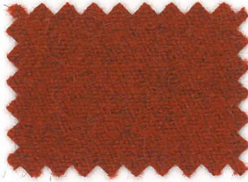
FEEL Up For It