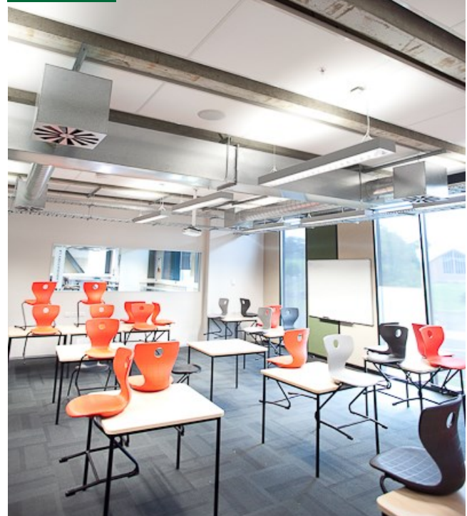
Goodman Feilder—Training Room