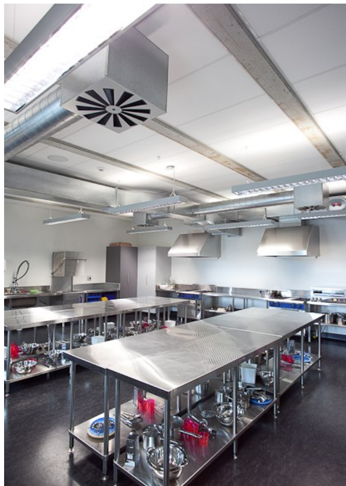
Albany High School—Food Tech Classroom