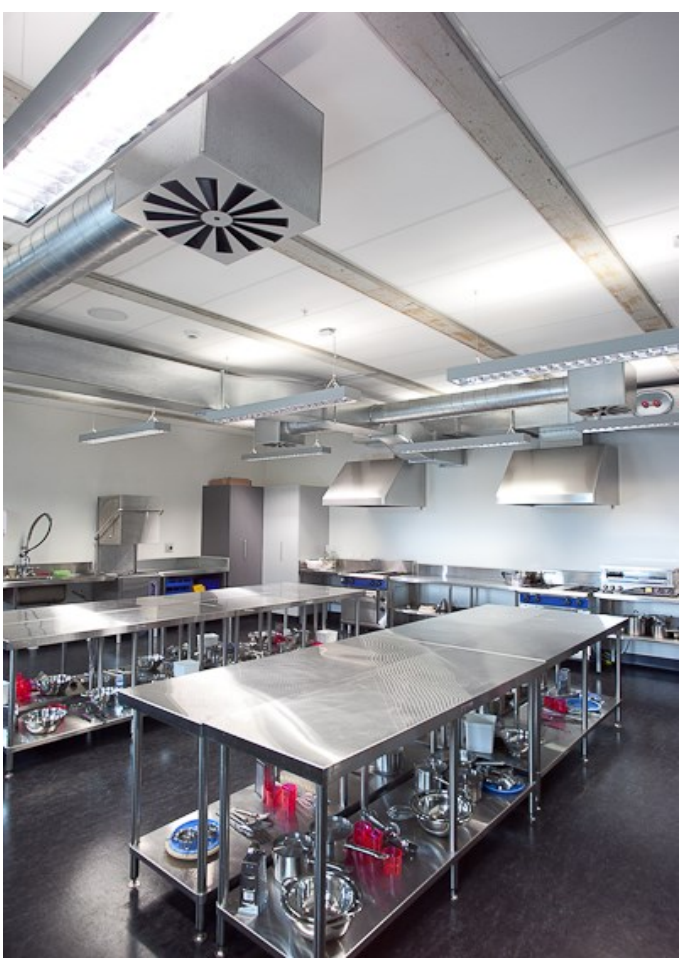
Albany High School—Food Tech Classroom