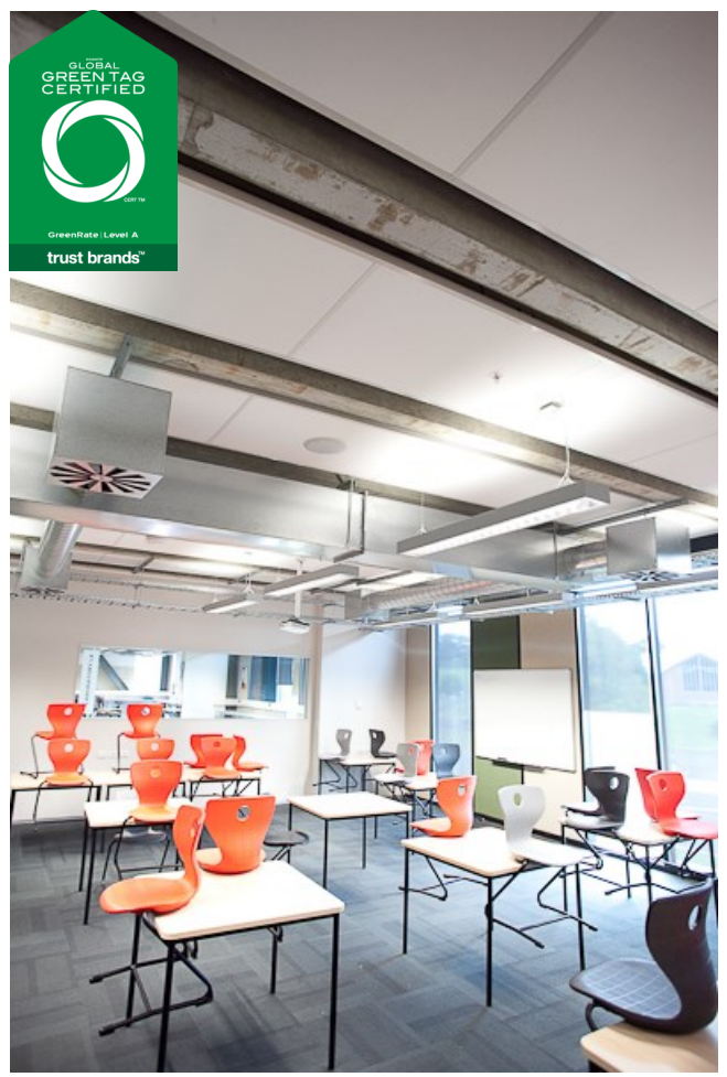
Goodman Feilder-Training Room

Shall not commence until the building is watertight and dry. This product is designed to be mounted into a two-way exposed grid system and installed to manufacturer's and AS/ NZS 2785:2020 Standard's requirements. Seismic design may require a suitably qualified engineer. Hold down clips may be required in areas of wind uplift, and/or air grilles used to balance air pressure. Care shall be taken when handling tiles to avoid damage.