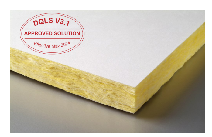
Photo: Triton 50, 2400 x 1200 panels direct fixed over plasterboard lining in retro fit of existing classroom.