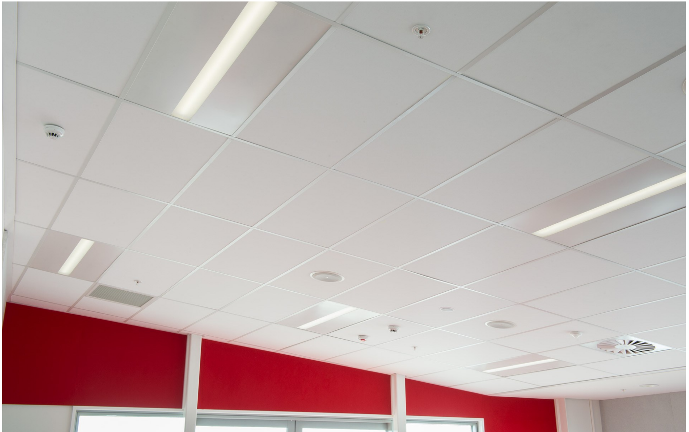
Photo: Haeata community college classroom