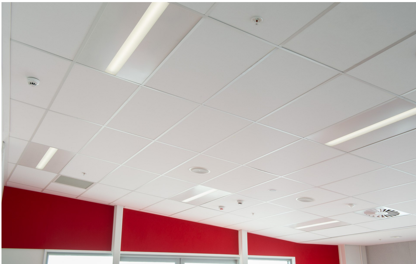
Photo: Haeata community college classroom