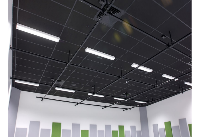
Photo: Hobsonville Point Secondary School, Triton 25 with black Sonatex facing