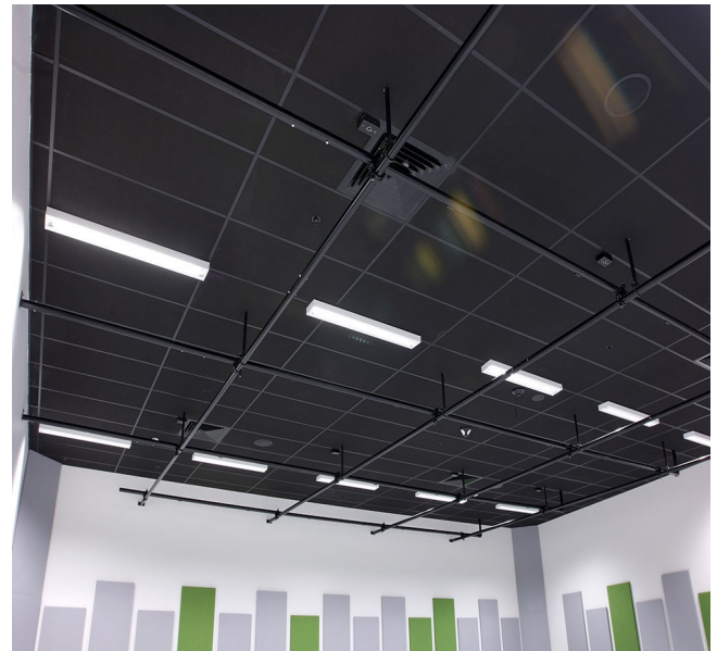
Photo: Hobsonville Point Secondary School, Triton 25 with black Sonatex facing