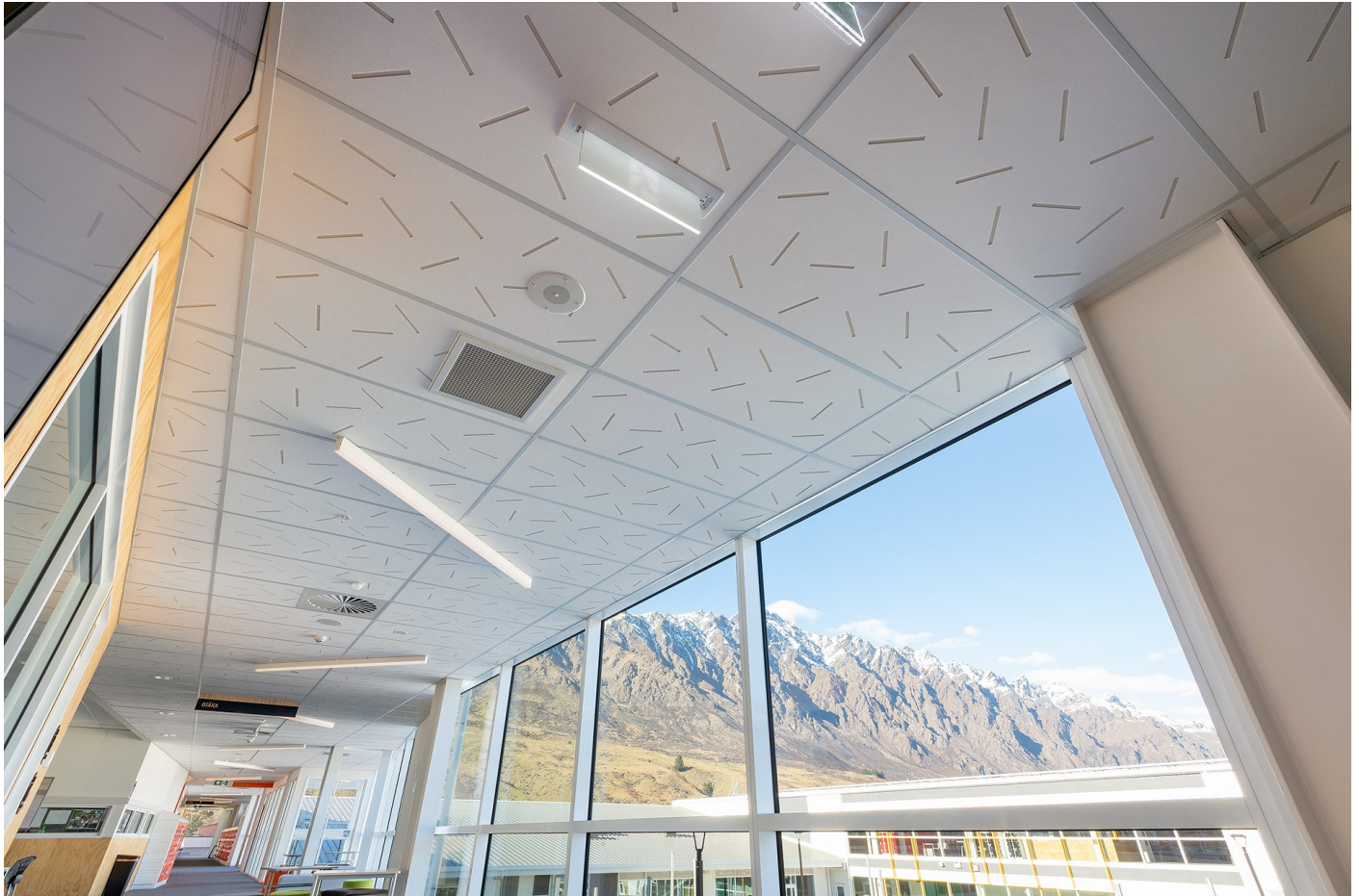
Photo: Wakatipu School, Triton 25, 600 x 1200 with Sonaris random slot perforated finish