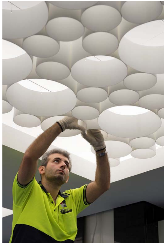
Installation of AO-Gami tubes in ASB Queen Street Branch

Supply and install AO-Gami™ acoustic paper tubes to (ceiling) as supplied by Asona Ltd Tel: 09 525 6575 Fax: 09 525 6579, # ( ), cell type (small) (medium) (large), Finish (natural), Colour ( )