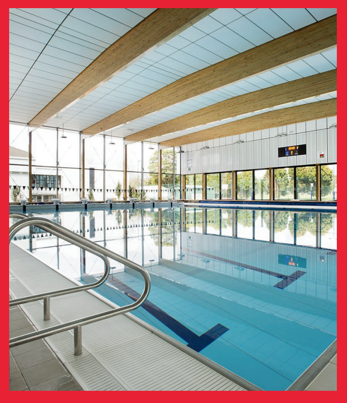
TECHNICAL DATA SHEET BPIR - CLASS 1