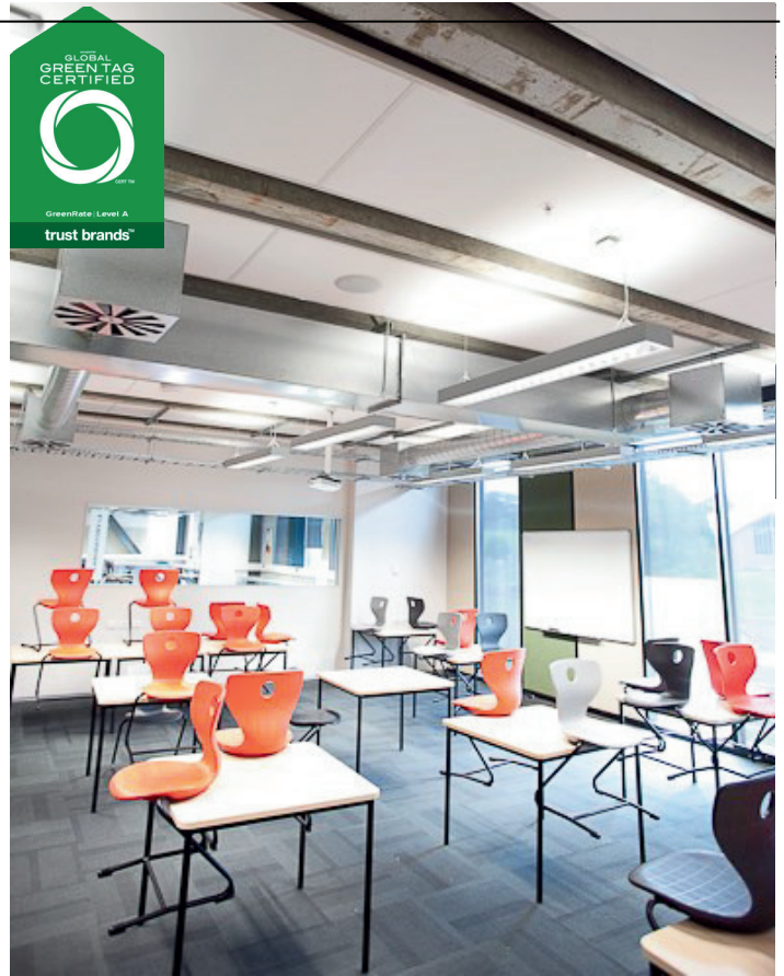
Goodman Feilder—Training Room

15 year limited warranty against manufacturing defects, extendable to 30 years when registered for Asona’s Renew and Reuse program.