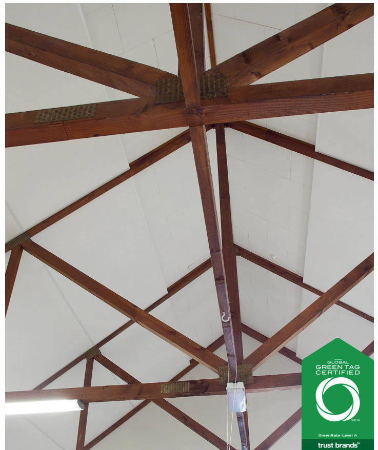
Photo: Triton 50, 2400 x 1200 panels direct fixed over plasterboard lining in retro fit of existing classroom.